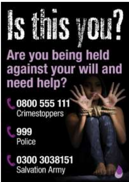
A6 Cubicle sticker