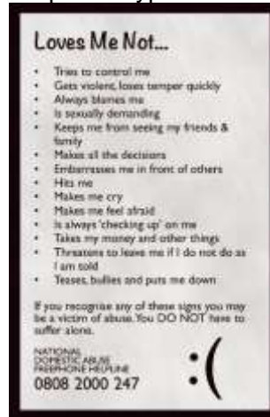
Loves me not card