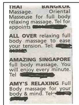
Massage/sauna – offering multinational women, suggestive?

Please direct all comments and questions to www.purpleteardrop.org.uk or send to: Purple Teardrop Campaign/SI Poole, PO Box 7234, Broadstone, Dorset BH18 0BB